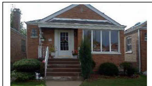
Figure 2. Photo of typical masonry home built between 1942-1978 less than 2 stories in Cook County, IL (group 4).