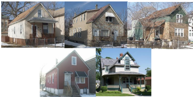
Figure 1. Frame homes included in project

As shown in Table 1, these 10 homes represent a mix of frame and brick construction. Figure 1 and Figure 2 depict the frame homes and brick homes included in the project.