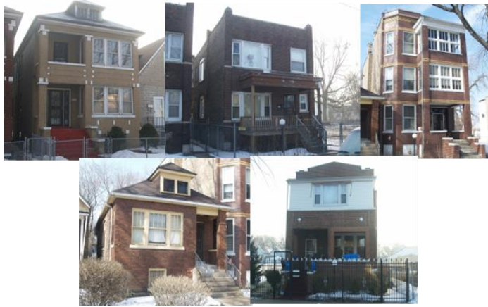
Figure 2. Brick homes included in project