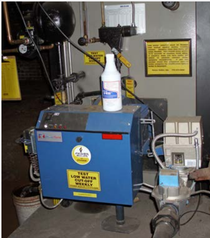
Retrofit measures included a new boiler.

For more information see the Building America report Quantifying the Financial Benefits of Multifamily Retrofits at buildingamerica.gov .