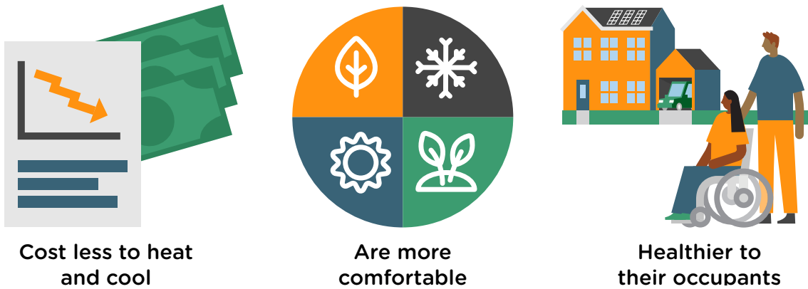
Figure 2. What are the Benefits of a High-Performing Home?

This paper is for professionals working with high-performing homes who want to successfully connect with the real estate and homebuying communities by using a suite of messaging opportunities that will truly resonate with those groups and lead to the consistent valuation of high-performing homes.