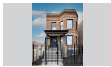
2-4 flats, Pre-1942 Brick/masonry construction Qty: 1,235