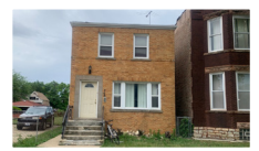
Single family, 1942-1978 Brick/masonry construction Qty: 60