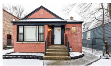
Single family, Pre-1942 Brick/masonry construction Qty: 1,744