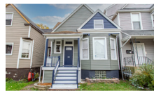
Single family, Pre-1942 Frame construction Qty: 874