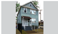
2-4 flats, Pre-1942 Frame construction Qty: 246