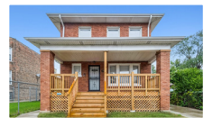
Single family, 1942-1978 Brick/masonry construction Qty: 428