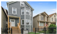
2-4 flats, Pre-1942 Frame construction Qty: 1,765

*Excludes single-family attached homes.