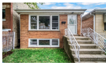
Single family, Pre-1942 Brick/masonry construction Qty: 1,051