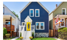
Single family, Pre-1942 Frame construction Qty: 1,798