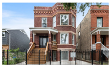
2-4 flats, Pre-1942 Brick/masonry construction Qty: 2,523