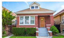
Single family, Pre-1942 Brick/masonry construction Qty: 2,343