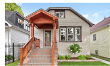
Single family, Pre-1942 Frame construction Qty: 1,459