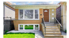
Single family, 1942-1978 Brick/masonry construction Qty: 558