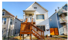
2-4 flats, Pre-1942 Frame construction Qty: 705

*Excludes single-family attached homes.